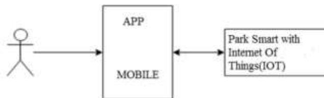
Figure 2: Data flow diagram of User Side Platform

As shown in figure 2, in User Side Platform section, the user will open the app, he will search for the nearest parking area, it checks for availability of free parking lot. If the parking lot is empty, the user will book the lot. After that he chooses for payment option then user id and payment information will be generated. The information about user and payment is updated in the database. The user will park the vehicle, and the timer will start when the user leaves the space timer will be stopped. The time is calculated, if the time exceeds than allotted time then the user has to pay once again and the database is updated that slot is free for parking.